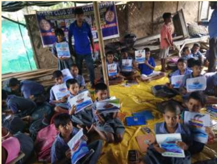
Drawing class held once a week