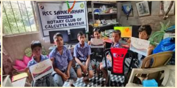
Computer Class held twice a week