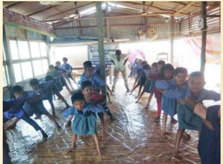
Yoga Classes held twice a week