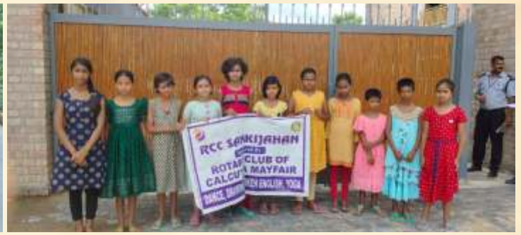
22nd July'24 : 15 girls from RCC SANKIJAHAN got admission in Joka Residential School for girls.