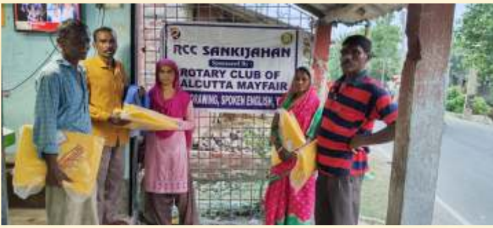
27th July'24 : Distributed Tirpal amongst the villagers for their roofs to provide protection from the rains.