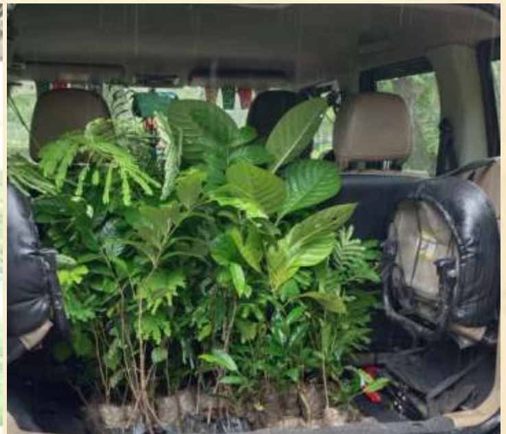
70 Fruit saplings were planted around the school.