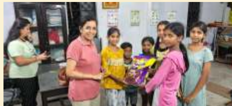
Distributed Choccos among the children of Prashikshan Tuition Centre