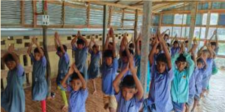
Dance Class held once a week