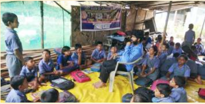
Spoken Class held once a week