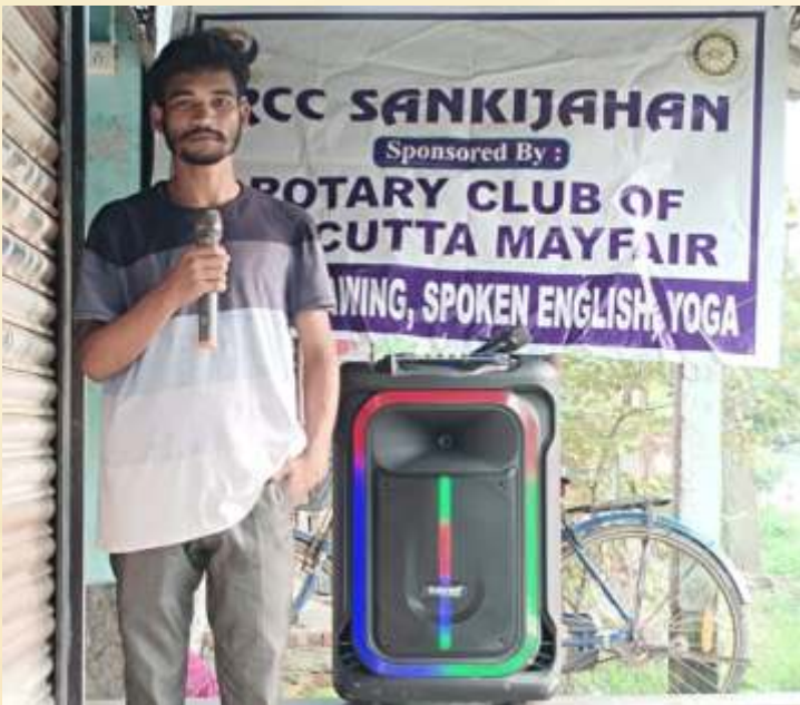
Provided a Sound System for announcements in the school.