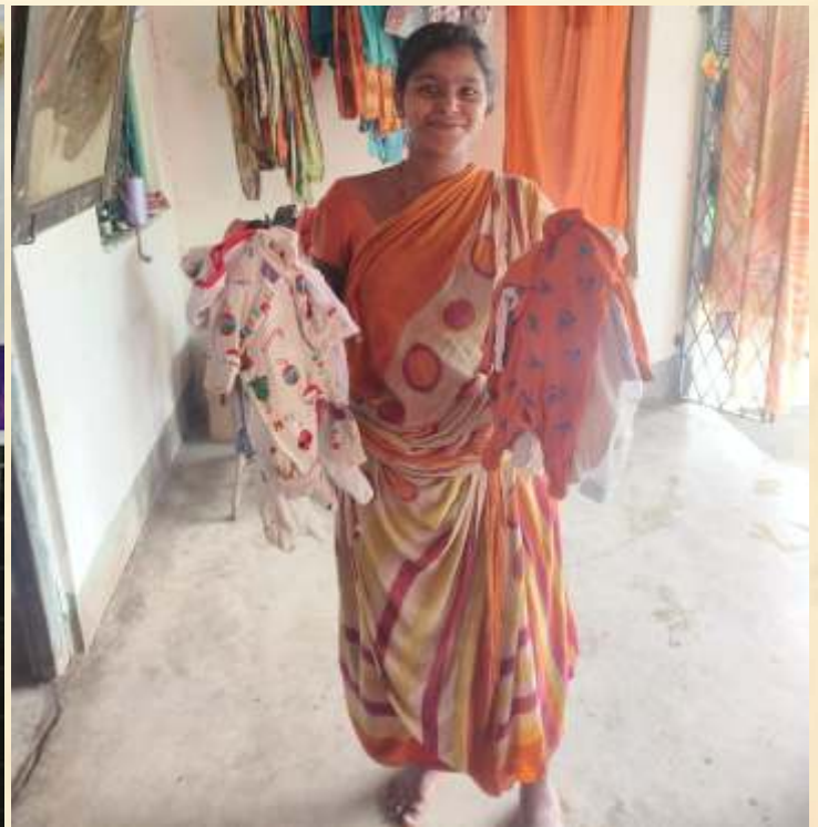
12th July'24: Old clothes were distributed among the villagers to provide them with much-needed clothing.